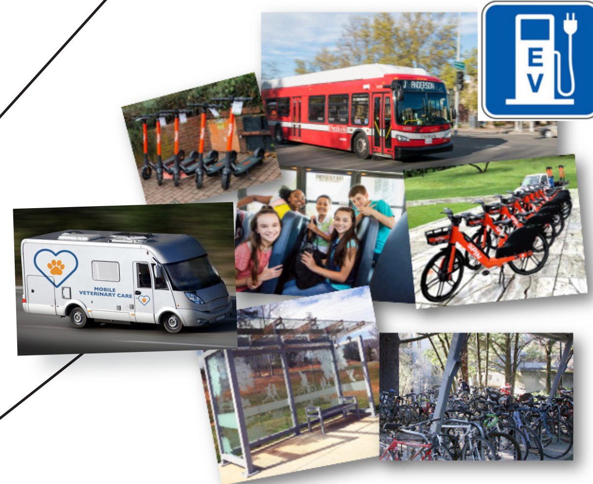
2.9 Acres Neighborhood Services. Offering Services not currently offered in this area