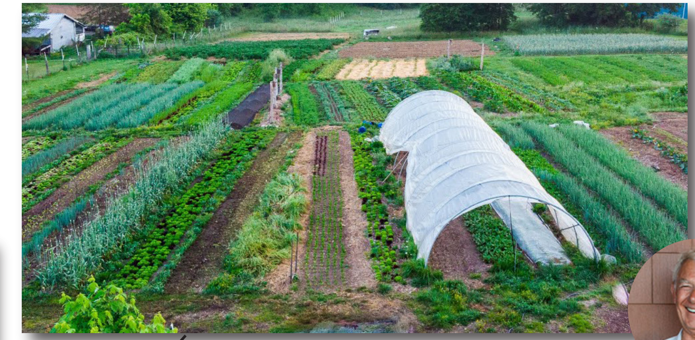
2.8 Acres Educational Farm for DJUSD programs