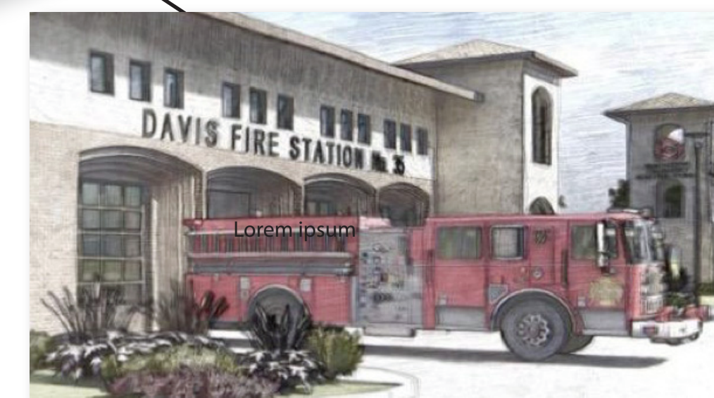
Improving response times to underserved North Davis outside the 5-min requirement