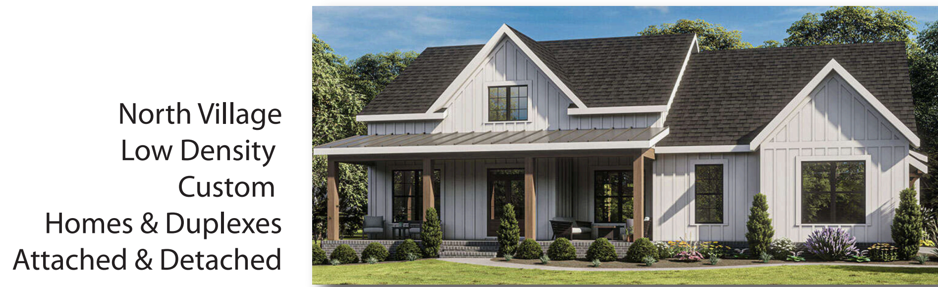
North Village Low Density Custom Homes & Duplexes Attached & Detached