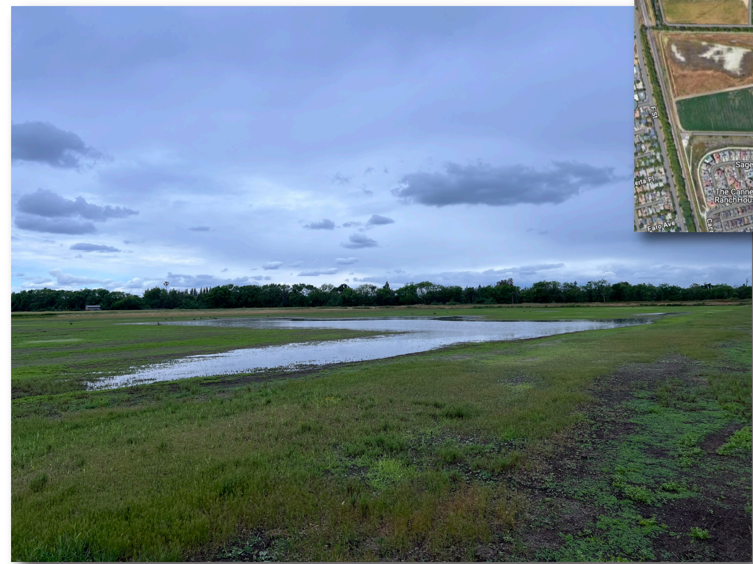
47.1 Acres Alkalai Playa. Preserved Natural Habitat