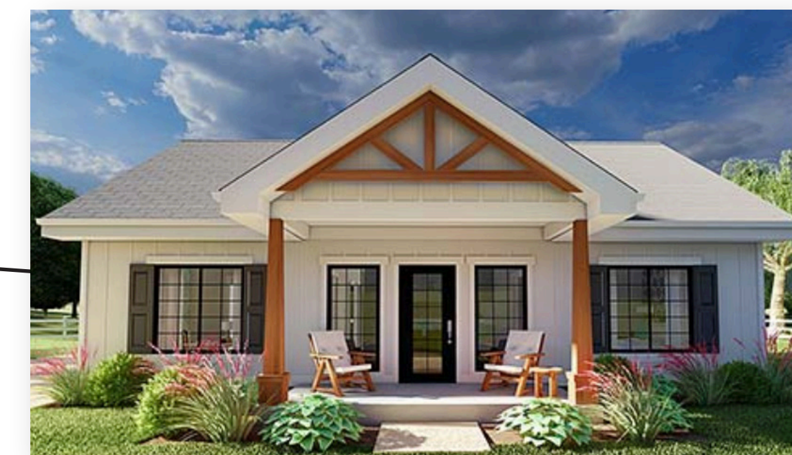
Parkside Village East & West Medium Density Typical Home Sizes 800 -1,250 sf Attached & Detached