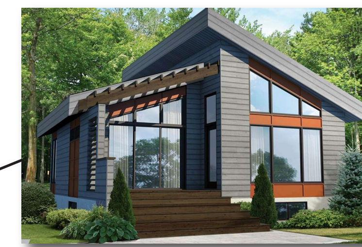
Central Village East & West Medium Density Typical Home Sizes 1,000 -1,600 sf Attached & Detached