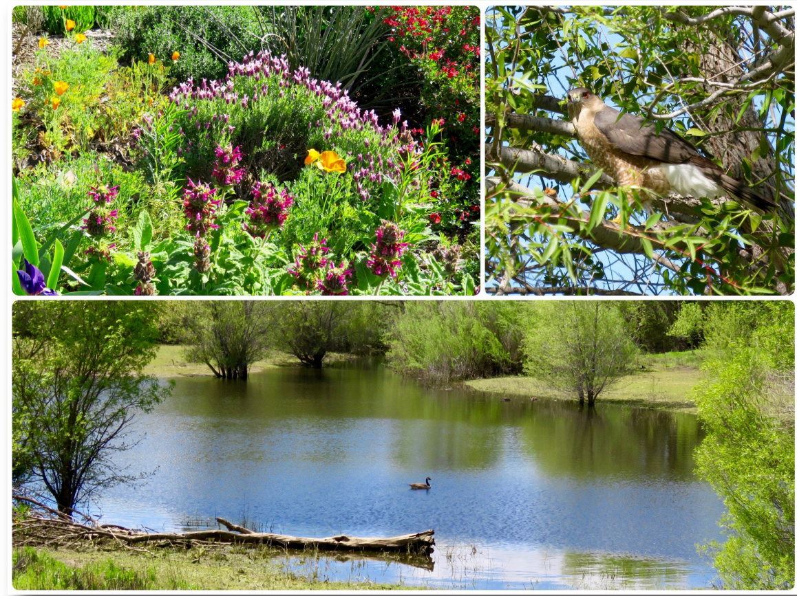
118.4 Acres Urban Ag Transition Area

Building upon Davis' legacy of thoughtful planning while strengthening our community's future.