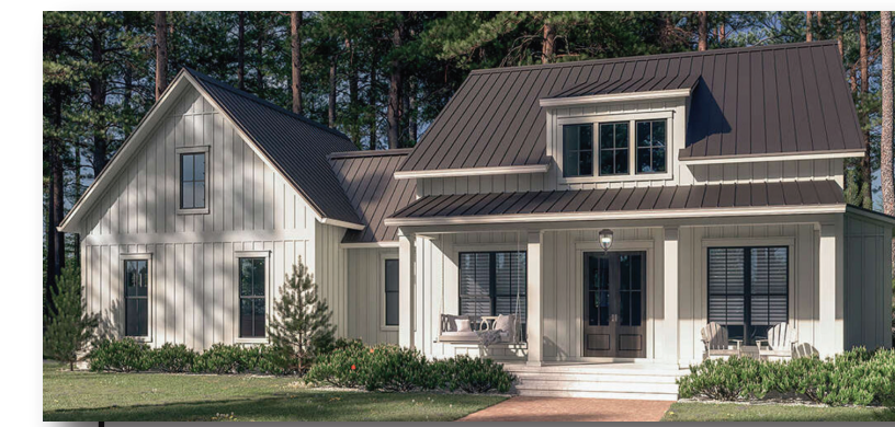
East Village Medium Density Typical Home Sizes 1,475 - 2,450 sf Attached & Detached