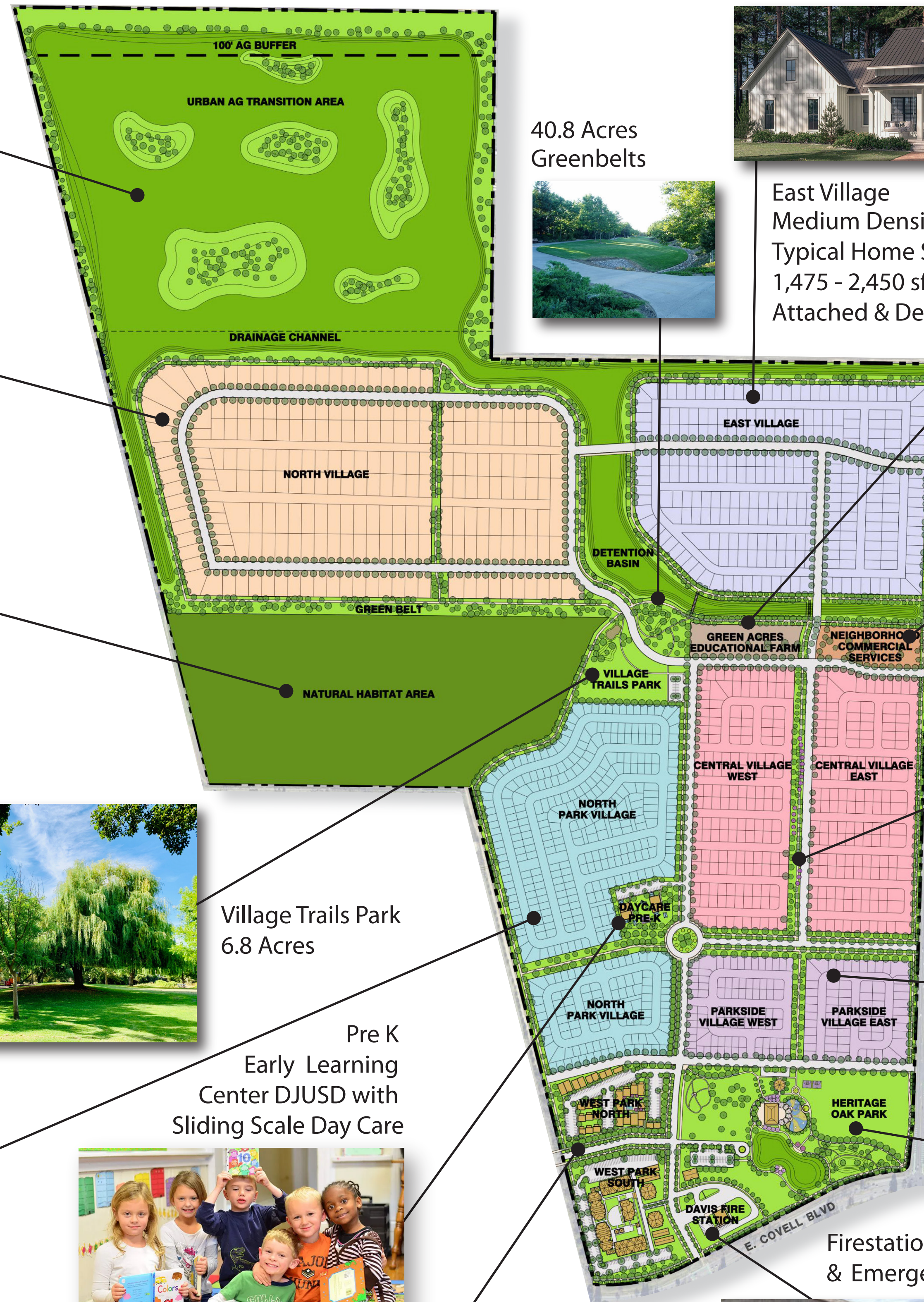
40.8 Acres Greenbelts