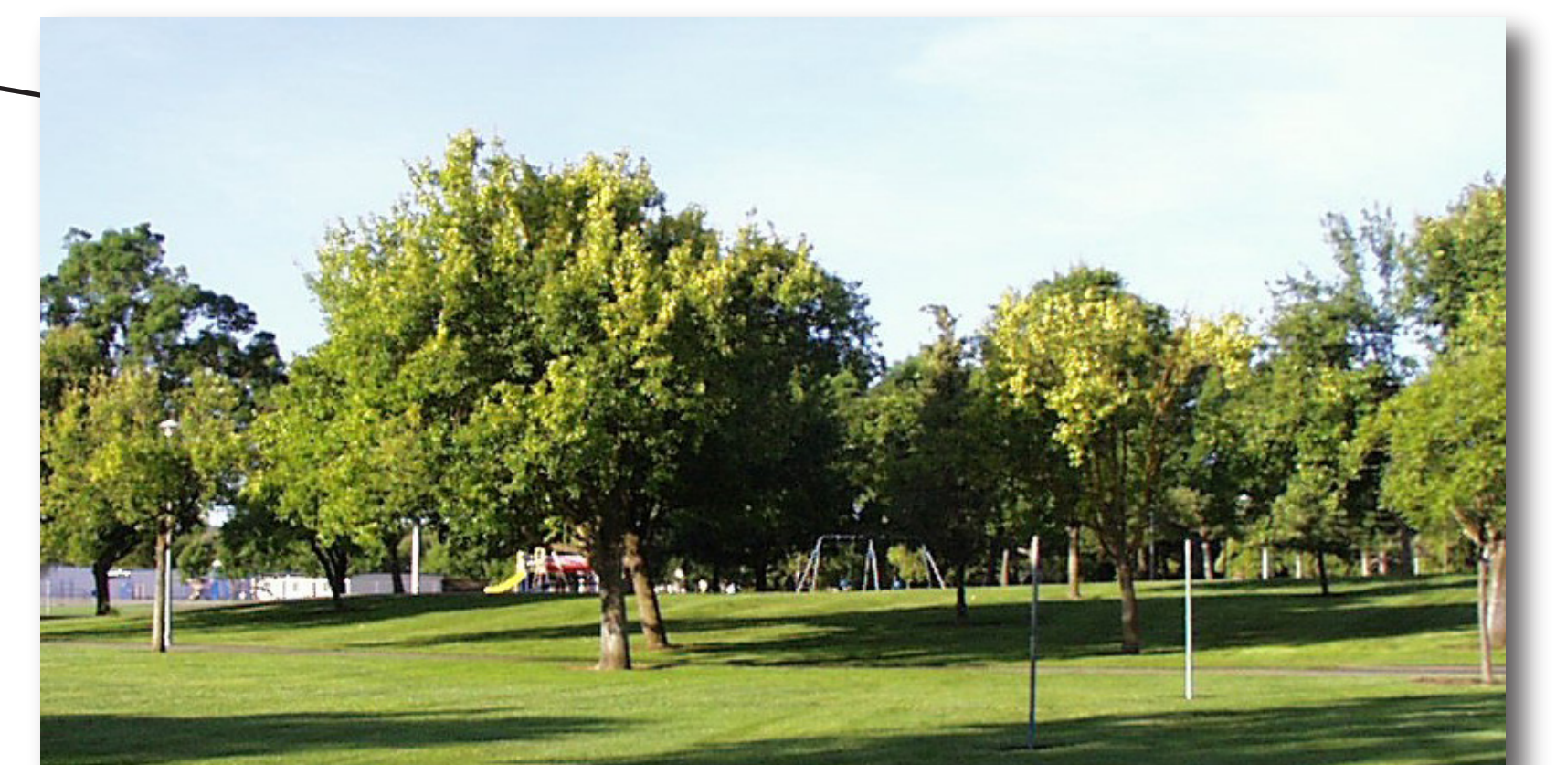
20.8 Acres. Heritage Oak Park